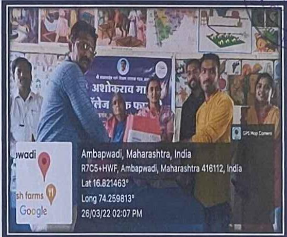
Tablet distribution(Haematonic& Albendazole)