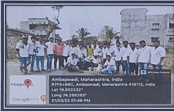
Plastic Mukht Abhiyan