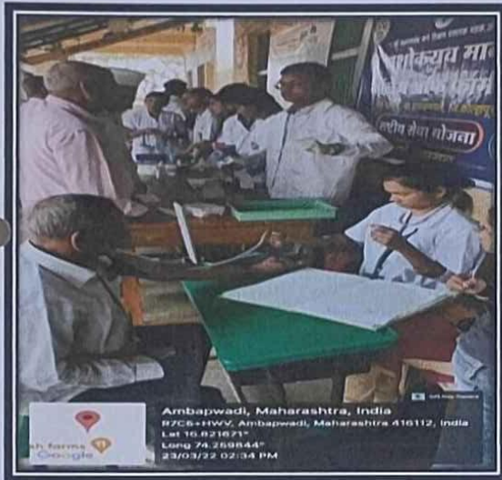
1. Blood Pressures Checkup