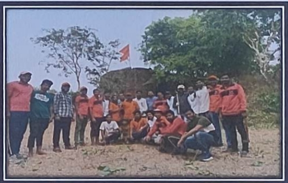
Azadi Ka Amrut Mahotsav- Historical fort conservation like Panhala&Pawangad.