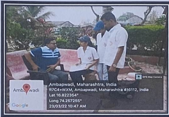
Health Survey by volunteers