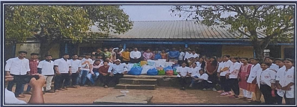
ManuskichiBhint- Clothes donation to needy, poor & orphan peoples through Mauli Seva Sanstha.