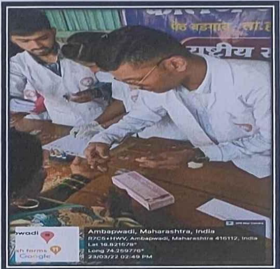
2. Blood Group Detection