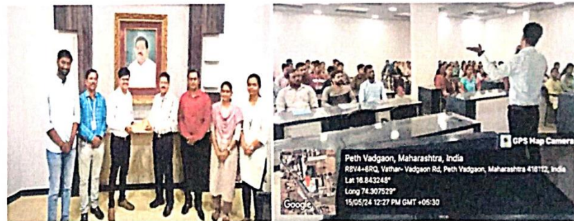
Photographs of Seminar on Current Pharma Trends in Technology Transfer & Process Control dated on Saturday, 15/06/2024 at 11:00 am